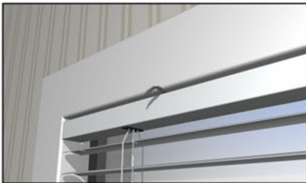
Lock the bracket by turning the lever. The top rail might be slightly sloped because of glazing bead.