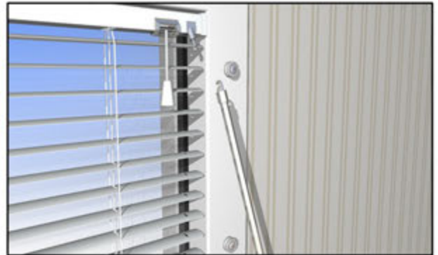
Place the turning rod's on it's ring. Cut the pull cords as short as possible, when blind is in lowest position. Fasten pull cord holders to window frame about twenty centimeters apart.