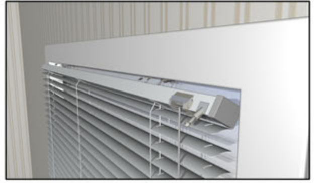
Tilt the top rail and set the rail on bracket's hooks.